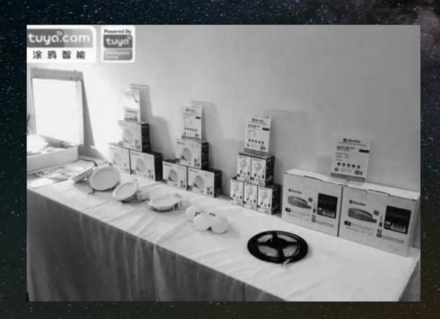
Top 1 lighting brand in Vietnam