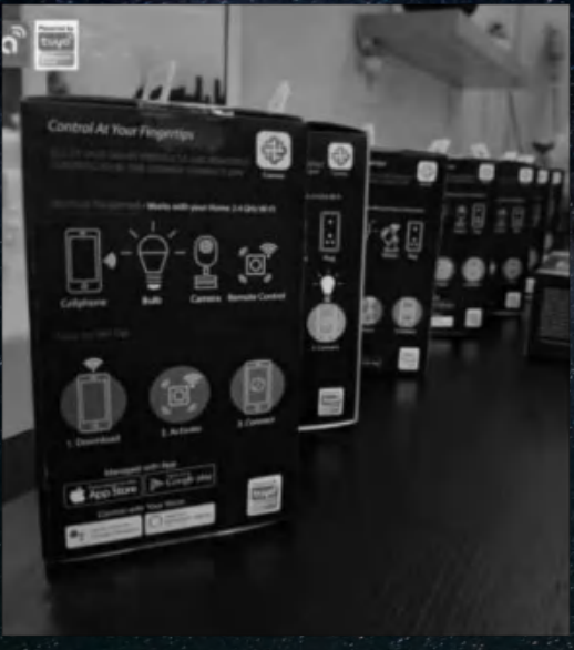
Top 1 consumer electronics brand in South Africa